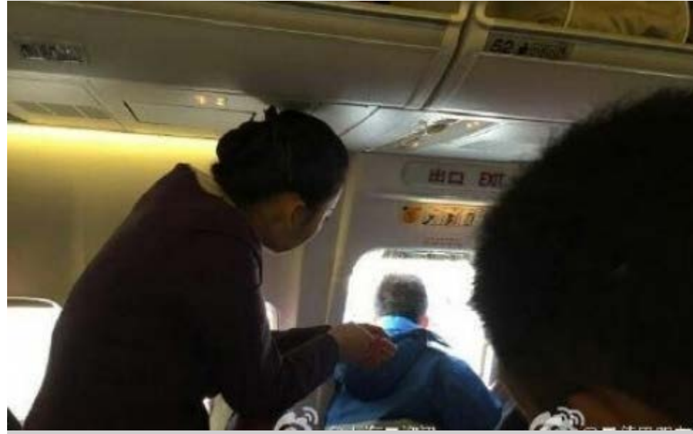
The first-time traveller opened the plane's emergency exit door to get some fresh air.

PUBLISHED : Tuesday, 16 December, 2014, 5:04pm UPDATED : Thursday, 18 December, 2014, 6:29pm