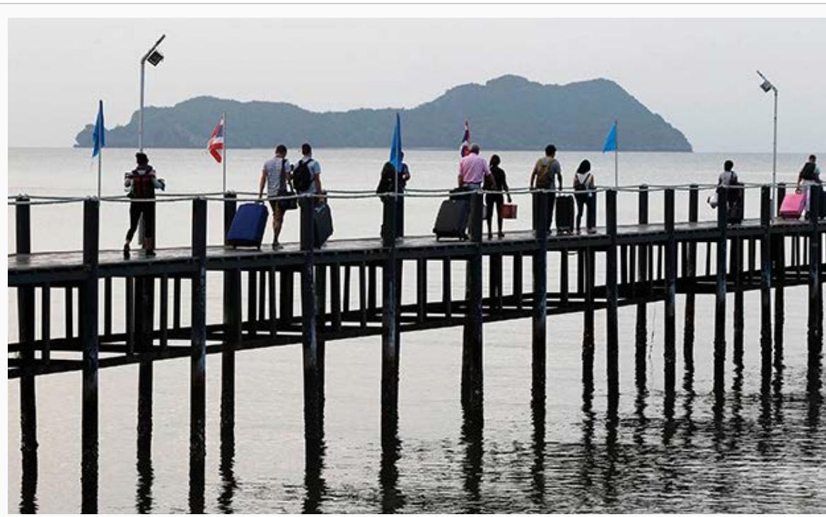
Tourists carry their luggage on a pier in Chumphon province on their way to the boat heading to the island of Koh Tao. Thailand's tourism minister said Tuesday that identification wristbands would be distributed to tourists nationwide when they check into hotels following the murder of two British backpackers on the island.

Tourism and Sports Minister Kobkarn Wattanavrangkul said she had approached hotels over the idea of handing out wristbands to help identify tourists that get lost or into trouble.