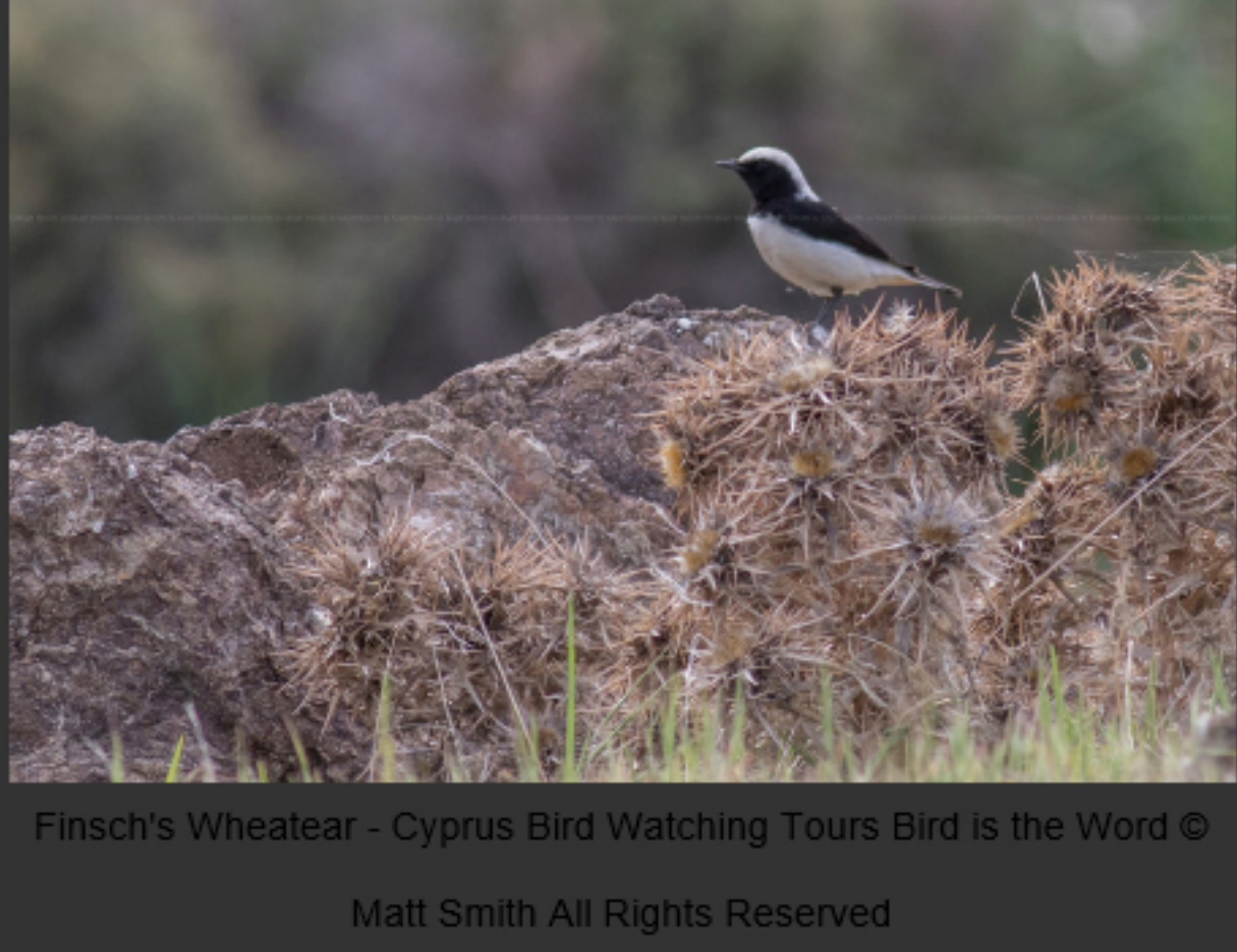
Finsch's Wheatear - Cyprus Bird Watching Tours Bird is the Word

We continued to Anarita Park for our Finsch's Wheatear. We located the male and female very quickly and also saw another Isabelline Wheatear of which to my amazement was attacked by the Finsch's Wheatear. It was always my belief that the Isabelline wheatears do all the attacking. Here I managed to get Aladdin incredibly close to the Male Finsch's Wheatear, quite a task considering how shy they are. We got a few more Cyprus Warbler here and Chukar and quite a few Woodlark. We also had great photo opportunities with singing Corn Bunting. We had a quick look around Agia Varvara, target here was the Zitting Cisticola for good photos ... we managed to get quite close to a few perched, one was flying quite erratically here and diving towards the other which could have been a display or forcing another male from its territory. Here we also got another Isabelline Wheatear providing frame filling photo opportunities.