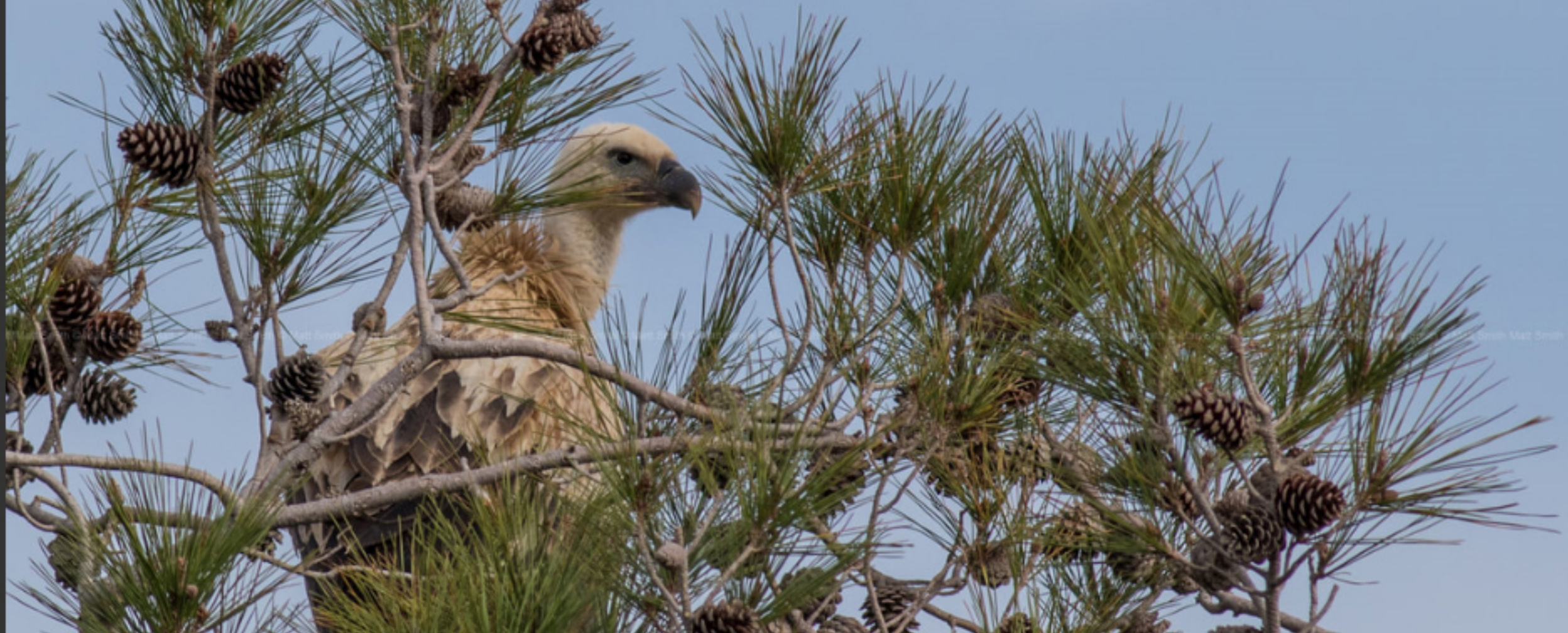
Eurasian Griffon Vulture - Cyprus Bird Watching Tours Bird is the Word