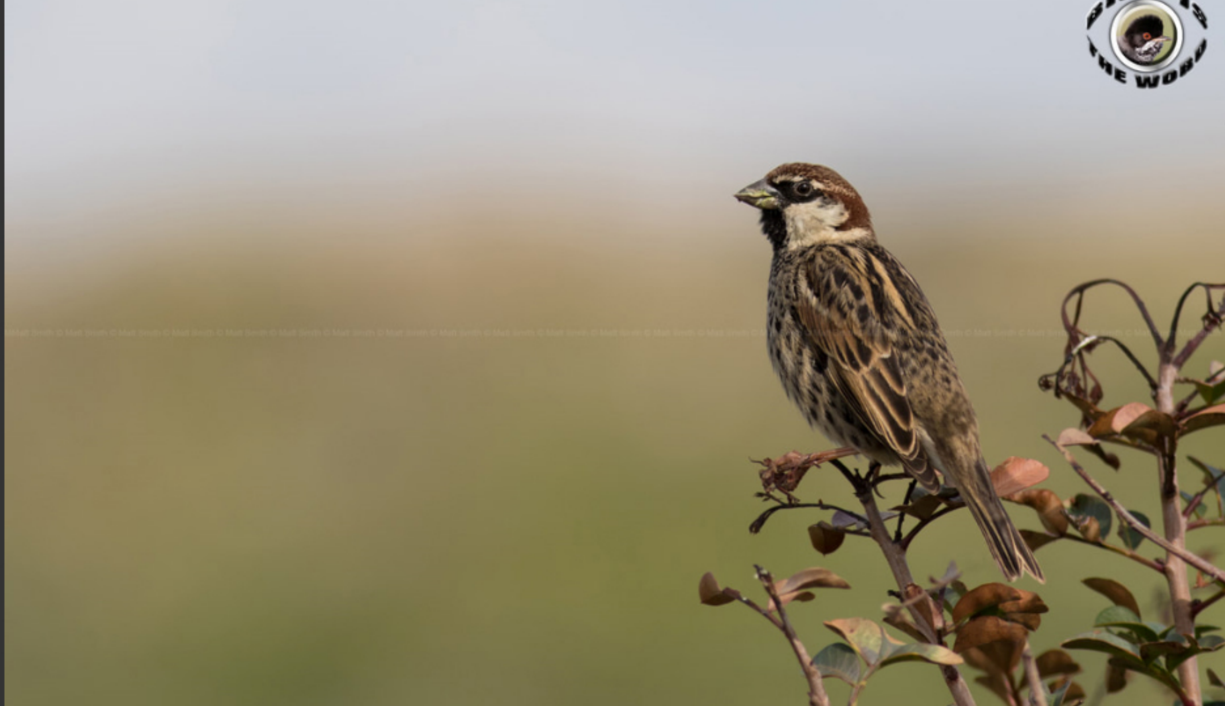
Spanish Sparrow - Cyprus Bird Watching Tours Bird is the Word

We then headed to Mandria for lunch and then had a quick sweep of the beach seeing Laughing Dove on the wires on the way. There was a European Shag on the rocks and plenty of Skylark in the fields but no sign of the Hen Harrier that has been showing well over the previous week. Spanish Sparrow providing some great photo opportunities here as did a Common kestrel.