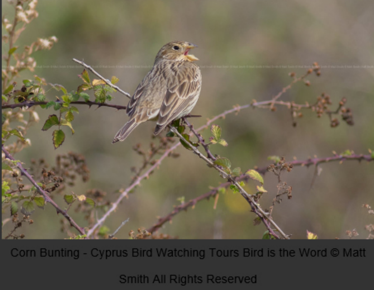
Corn Bunting - Cyprus Bird Watching Tours Bird is the Word

We then headed to Mandria for lunch and then had a quick sweep of the beach seeing Laughing Dove on the wires on the way. There was a European Shag on the rocks and plenty of Skylark in the fields but no sign of the Hen Harrier that has been showing well over the previous week. Spanish Sparrow providing some great photo opportunities here as did a Common kestrel.