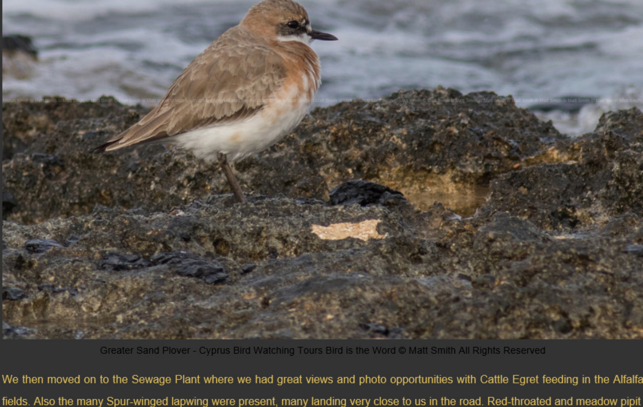
Greater Sand Plover - Cyprus Bird Watching Tours Bird is the Word

We then moved on to the Sewage Plant where we had great views and photo opportunities with Cattle Egret feeding in the Alfalfa fields. Also the many Spur-winged lapwing were present, many landing very close to us in the road. Red-throated and meadow pipit were in large numbers here and we managed a very close photo opportunity with a male European Stonechat here as promised. There was a Grey Wagtail on the waste area singing away but sadly no Bluethroat yet but a suprise show was a very early Common Nightingale very briefly seen flying into some dense vegetation on the side of the road as leaving the site.