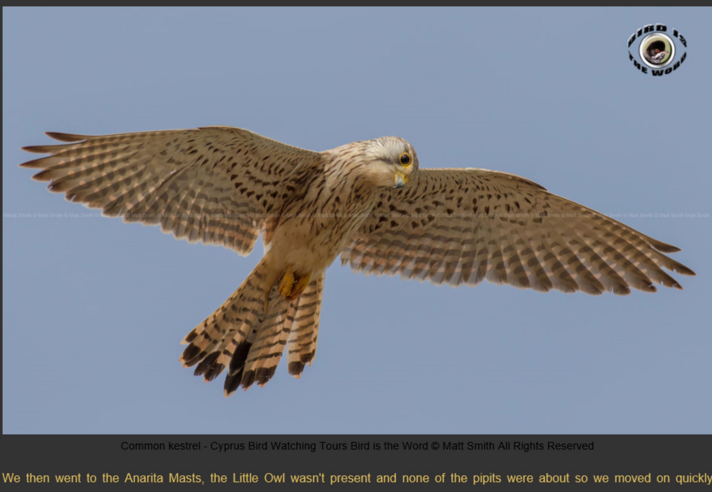
Common kestrel - Cyprus Bird Watching Tours Bird is the Word

We then went to the Anarita Masts, the Little Owl wasn't present and none of the pipits were about so we moved on quickly checking Kouklia fish farm on the way for the Salvonian Grebe which sadly must have moved on. We stopped in at Episkopi to try for the Vultures again. This time we had one sitting on the cliffs and flew very close as we were heading back. I then noticed one sitting in a pine tree as we were leaving the site... fantastic!