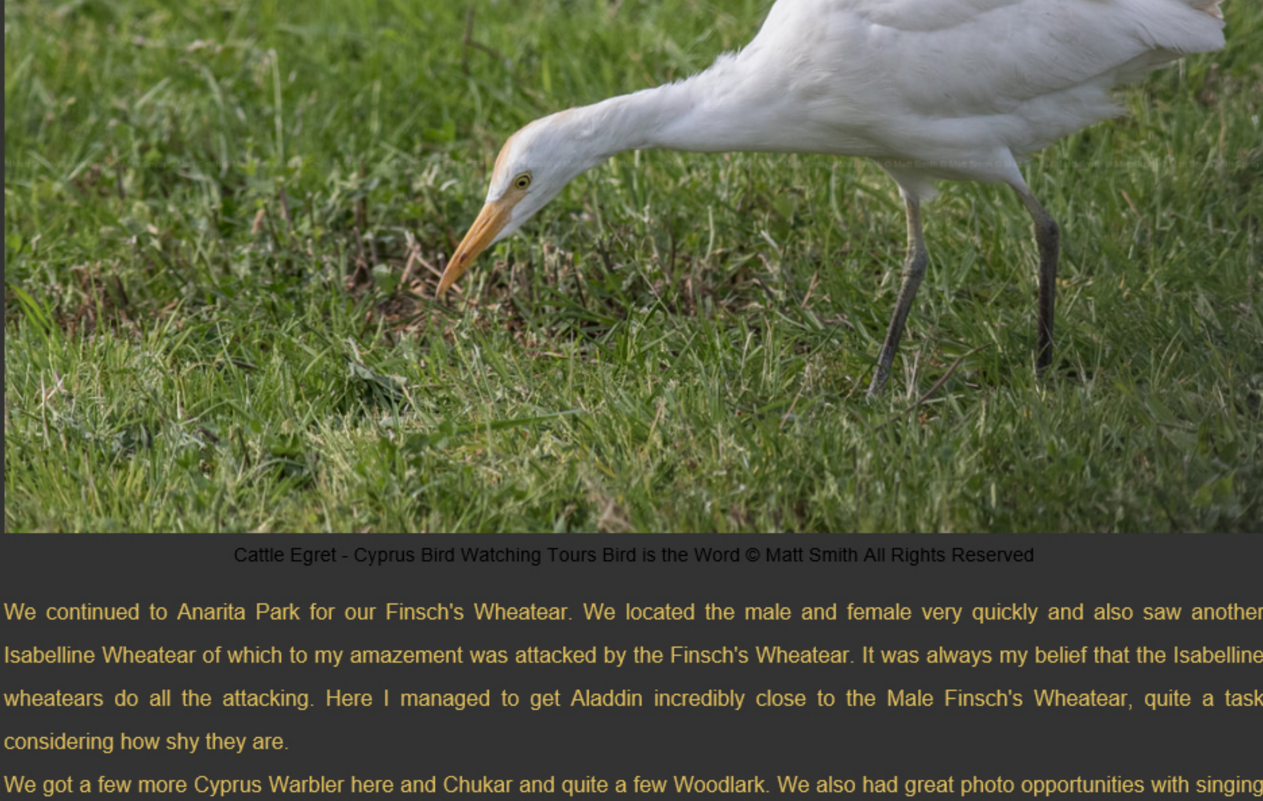
Cattle Egret - Cyprus Bird Watching Tours Bird is the Word

We then moved on to the Sewage Plant where we had great views and photo opportunities with Cattle Egret feeding in the Alfalfa fields. Also the many Spur-winged lapwing were present, many landing very close to us in the road. Red-throated and meadow pipit were in large numbers here and we managed a very close photo opportunity with a male European Stonechat here as promised. There was a Grey Wagtail on the waste area singing away but sadly no Bluethroat yet but a suprise show was a very early Common Nightingale very briefly seen flying into some dense vegetation on the side of the road as leaving the site.